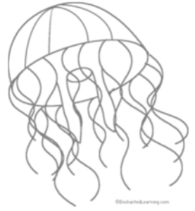
Figure 5 Medusozoa