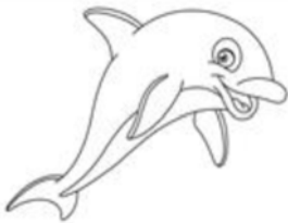
Figure 2 Delphinidae