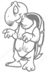
Figure 1 Chelonia