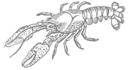
Figure 3 Crustacea